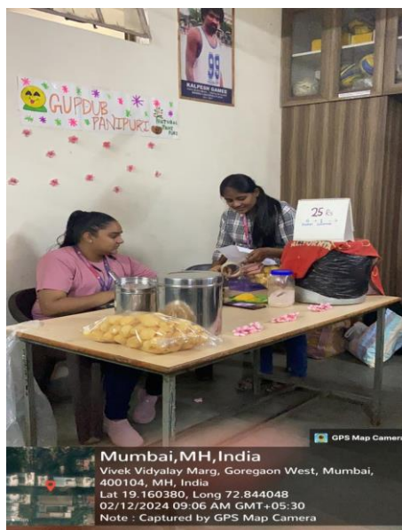
Caption: Some glimpses from the Annapurna Yojana Project