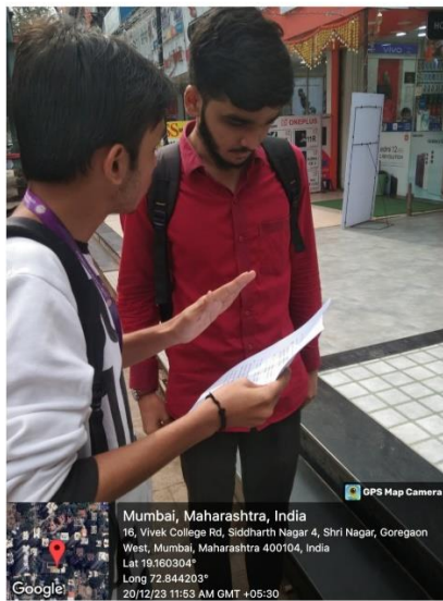
Caption: Some glimpses from our Election Awareness Campaign.