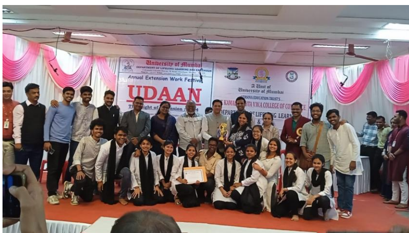
Caption: Some glimpses from the Udaan Festival

Annapurna Yojana is a DLLE project in which students sell their homemade food in college near the gymkhana and check whether they've made any profits or have managed to break even their investment in conducting the activity.