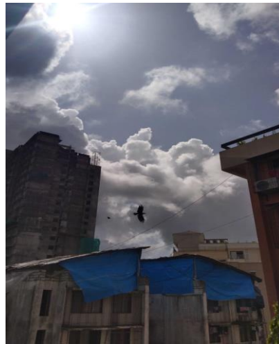
Caption: Some mesmerizing entries from the Photography Competition